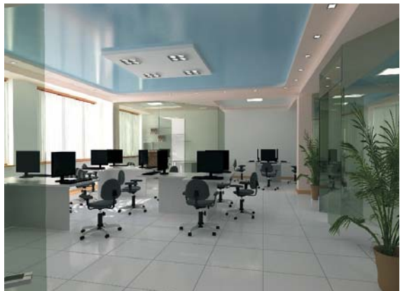
Architectural Design: R & D Workspace