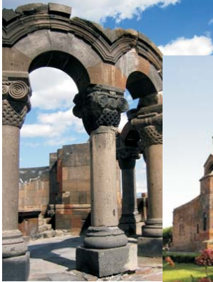
Ruins of Zvartnotc