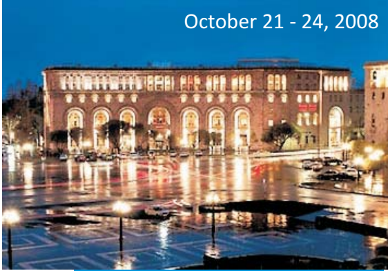
Location: Armenia Marriott Hotel Yerevan

The Global Innovation Forum in Yerevan is a follow up engagement to last year's Global Forum on Youth and ICT for Development held in Geneva, Switzerland in September. UN GAID, ITU, Athgo and many other partners brought together over 600 young people from around the world to have an open discussion on technology's role in advancing people's lives.